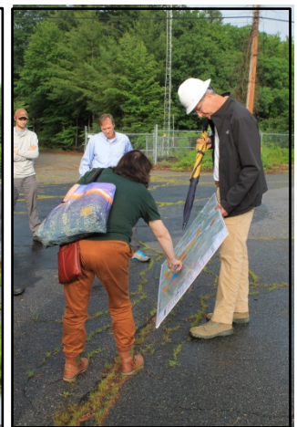
June 2019 Site visit at 2229 Main Street - NMI/Starmet Site

If you are unable to attend, your comments may be sent to the Town committee at NMIStarmetReuse@concordma.gov