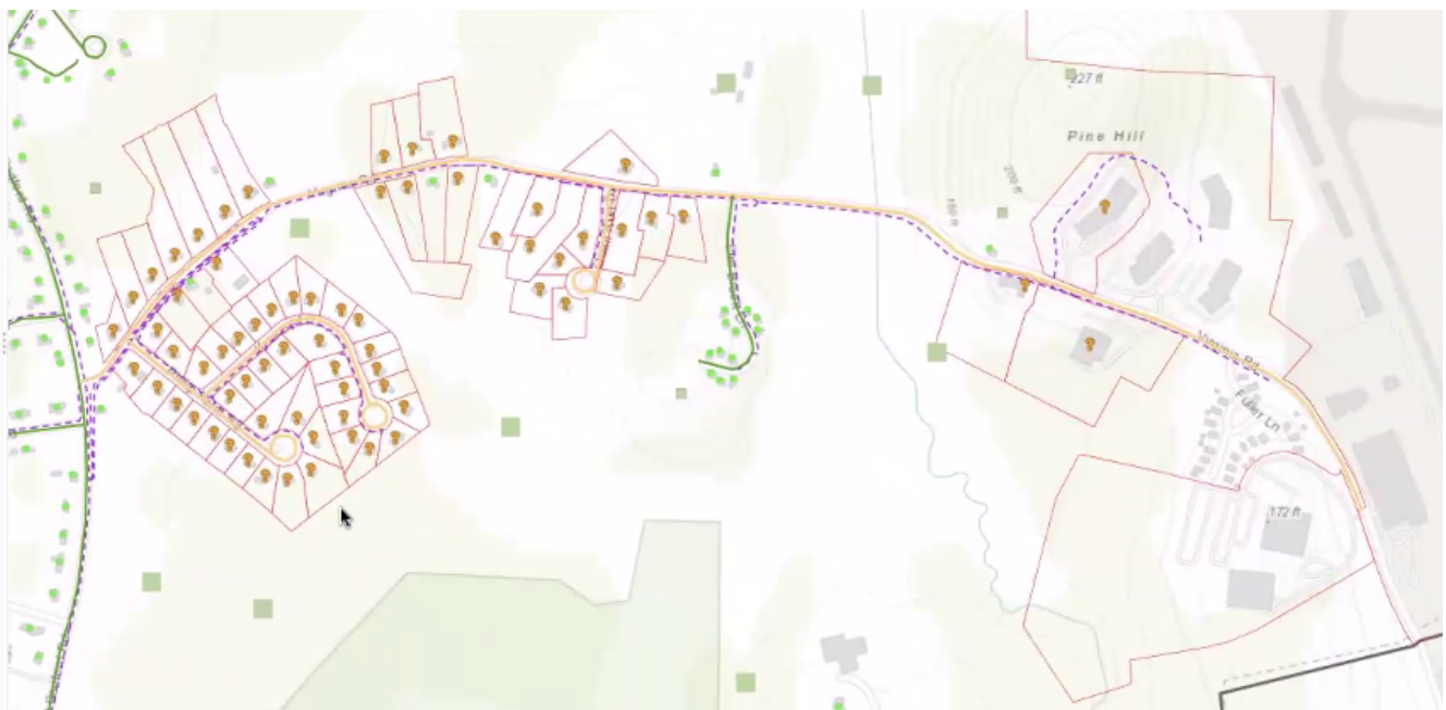
Figure 3: Virginia Road – with possible 28 parcels – 1 MDU

Virginia Road and attached streets is also an interesting case from Mark's review.