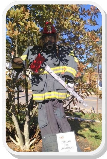
Firefighter Scarecrow@ CFPL Festival

Residents are invited to visit the 1 st Annual Scarecrow Festival at the Concord Free Public Library (CFPL) now on display at the Main Library through Saturday, October 24 th . Town departments submitted scarecrows that reflect their occupations and the STEAM skills needed for their work as part of the Library's LSTA Full STEAM Ahead grant.