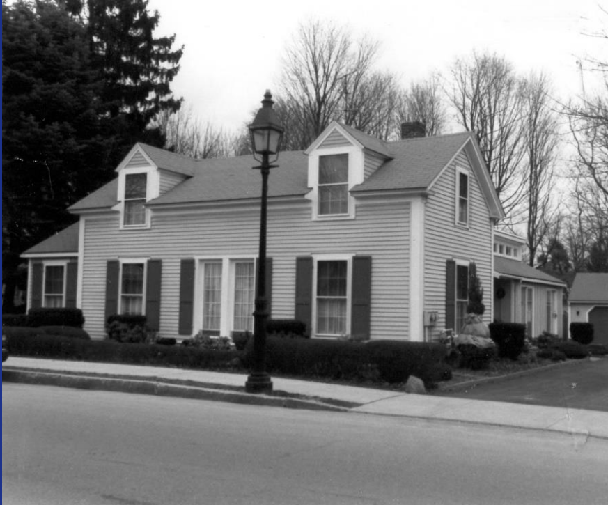
29-31 Thoreau Street

The house at 29-31 Thoreau Street was built around 1843 as a double cottage. The property was owned for years by the Gleason family.