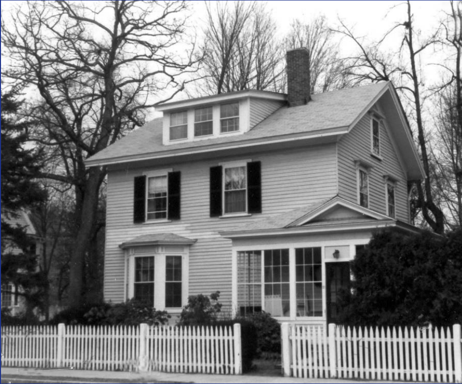
21 Thoreau Street

The house at 21 Thoreau Street was originally built around 1862 on the property of 252 Main Street. The house was moved in 1891 or 1892 to its current location.