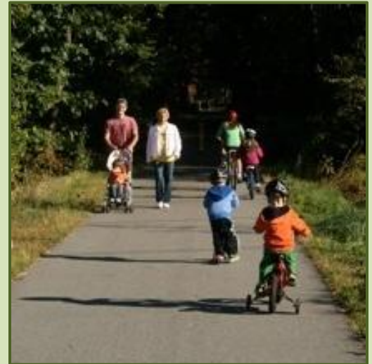
Image and map provided by the Friends of the Bruce Freeman Rail Trail

The BFRT is open to non-motorized uses such as walking, cycling, inline skating, cross-country skiing and is designed to accommodate accessible equipment.