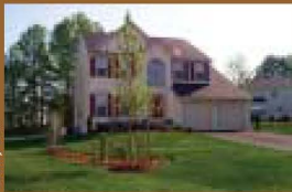
Residential Lot with Bioretention Somerset Development Prince George's County, MD

Ever wish you could simultaneously lower your site infrastructure costs, protect the environment, and increase your project's marketability? With LID techniques, you can. LID is an ecologically friendly approach to site development and storm water management that aims to mitigate development impacts to land, water, and air. The approach emphasizes the integration of site design and planning techniques that conserve the natural systems and hydrologic functions of a site.