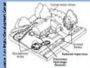
LID Low-Impact Development Control

Water moving through these systems is slowed, filtered, and percolated into the ground. These systems are an alternative to curbs, gutters, and pipes.