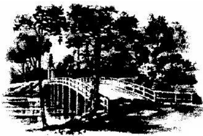
Old North Bridge