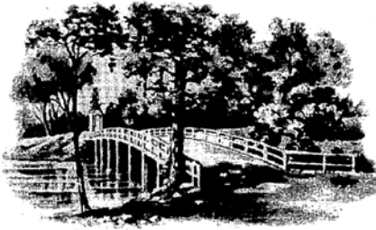
OLD NORTH BRIDGE

TOWN OF CONCORD TOWN MANAGER'S OFFICE 22 MONUMENT SQUARE - P.O. BOX 535 CONCORD, MASSACHUSETTS 01742