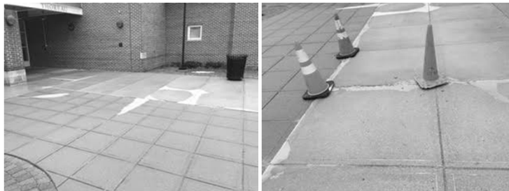
FY18 Plans – Thoreau Sidewalk