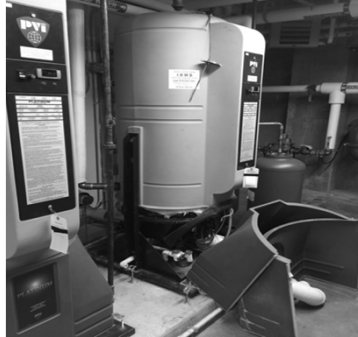
Willard School Hot Water Heater Replacement