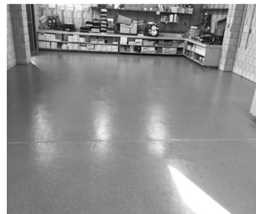
Ripley Copy Center Asbestos Flooring Replacement