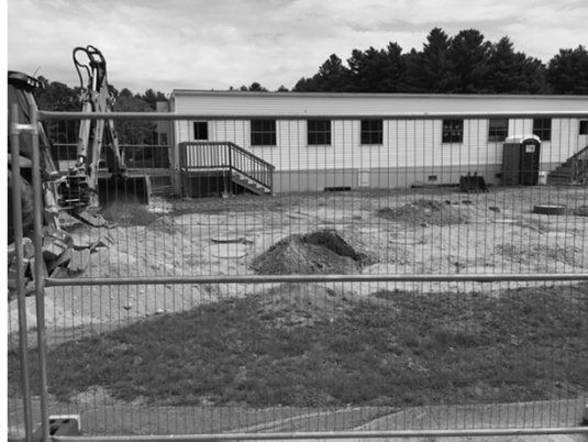
Sanborn Modular Classrooms Installed