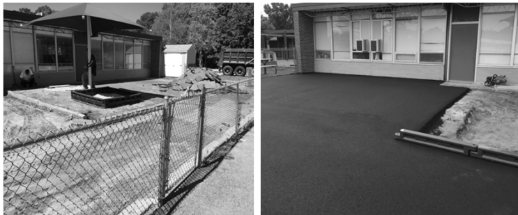
Ripley Preschool Playground Area